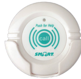
Call Button TL-4015NC