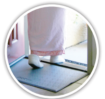
Corded Floor Mat