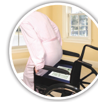
Corded Chair Pad