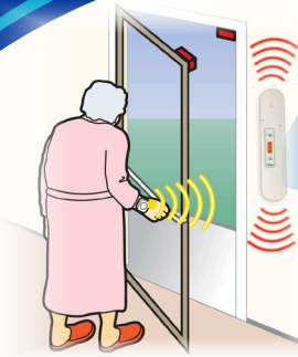
DepartAlert® Door Bar System TL-4005SYS