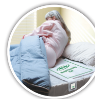
Corded Bed Pad