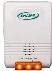
Emergency Call Alert 4017-ECA