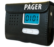
Caregiver Pager TL-4016P